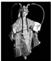
DING MEI KUI